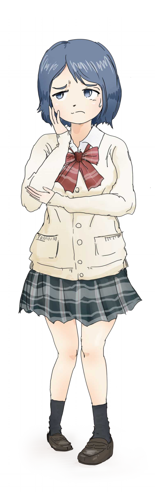
Yep, I was now the "I-Forgot" kid.